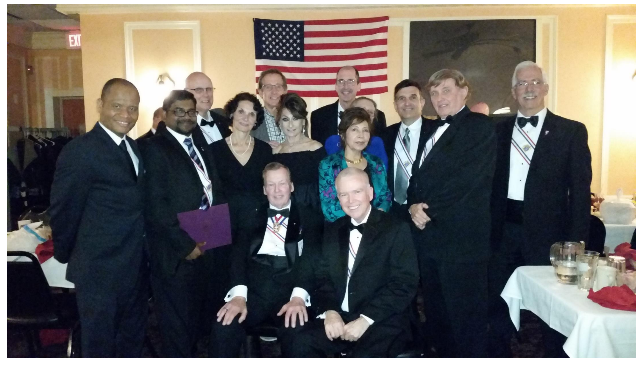
New Fourth Degree Party – January 2018